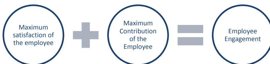
Figure 1 The Engagement Equation (Rice et al 2012)